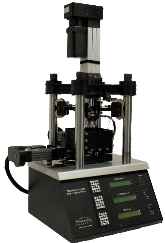
Bidirectional Cyclic Direct Simple Shear System